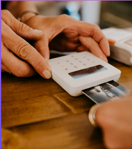
OSU Credit Card